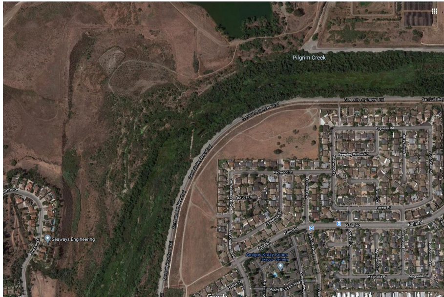
The City can explore urban design elements and land use allowances that provide better connections to the San Luis Rey River for both residents and visitors